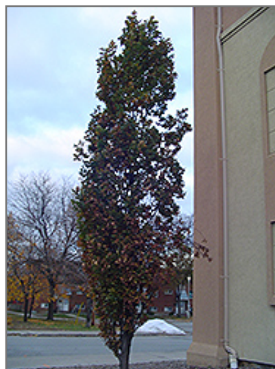
Pyramidal English Oak in fall