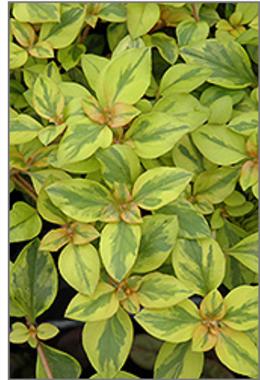
Walkabout Sunset Loosestrife foliage

Walkabout Sunset Loosestrife is recommended for the following landscape applications;