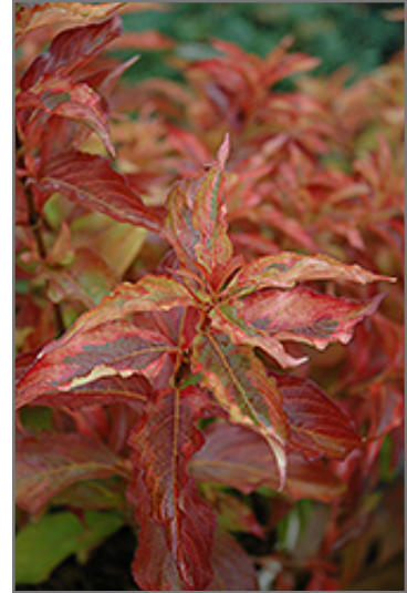
My Monet Sunset Weigela in fall

This shrub should only be grown in full sunlight. It prefers to grow in average to moist conditions, and shouldn't be allowed to dry out. It is not particular as to soil type or pH. It is highly tolerant of urban pollution and will even thrive in inner city environments. This is a selected variety of a species not originally from North America.