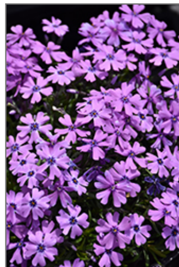
Purple Beauty Moss Phlox flowers