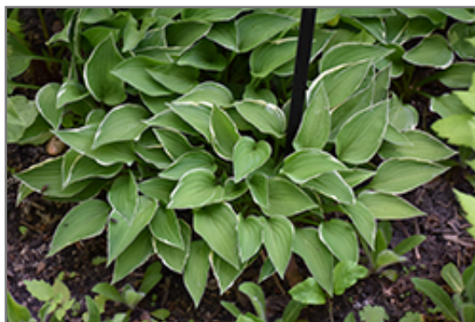
Allan P. McConnell Hosta foliage