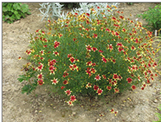
Route 66 Tickseed