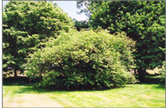
American Hazelnut

American Hazelnut will grow to be about 12 feet tall at maturity, with a spread of 8 feet. It tends to be a little leggy, with a typical clearance of 2 feet from the ground, and is suitable for planting under power lines. It grows at a medium rate, and under ideal conditions can be expected to live for approximately 30 years. While it is considered to be somewhat self-pollinating, it tends to set heavier quantities of fruit with a different variety of the same species growing nearby.