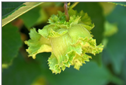
American Hazelnut fruit