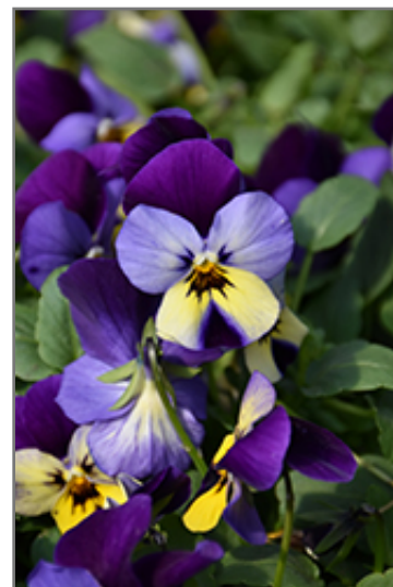
Endurio Blue Yellow with Purple Wing Pansy flowers