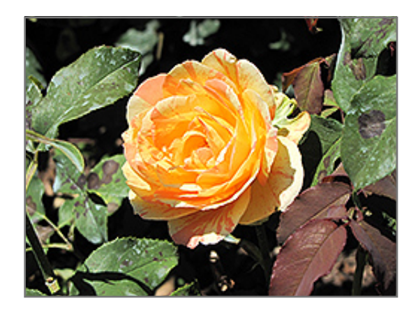
Rainbow Niagara Rose flowers