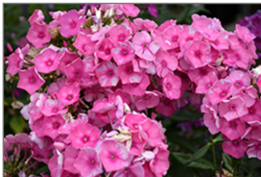
Bubble Gum Pink Garden Phlox flowers