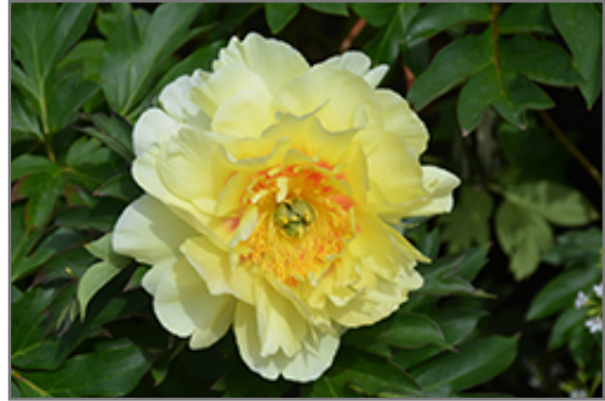
Bartzella Peony flowers