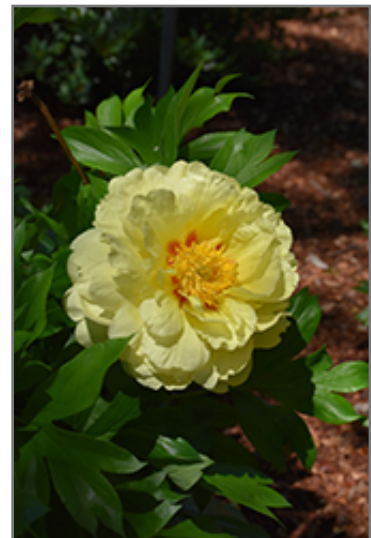
Bartzella Peony flowers