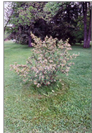
Black Chokeberry in bloom