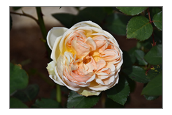
Jude The Obscure Rose flowers