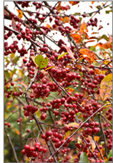
Prairifire Flowering Crab fruit

This tree should only be grown in full sunlight. It prefers to grow in average to moist conditions, and shouldn't be allowed to dry out. It is not particular as to soil type or pH. It is highly tolerant of urban pollution and will even thrive in inner city environments. This particular variety is an interspecific hybrid.