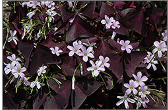
Purple Shamrock flowers