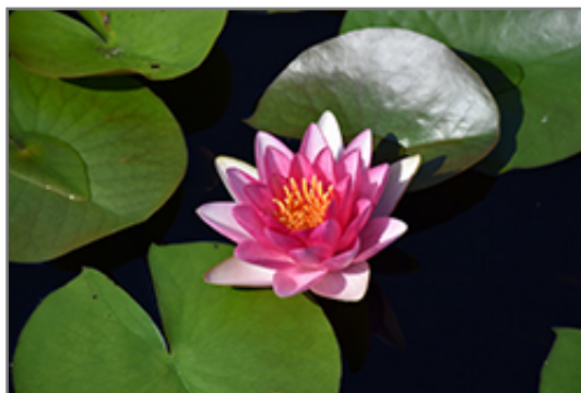
Attraction Hardy Water Lily flowers