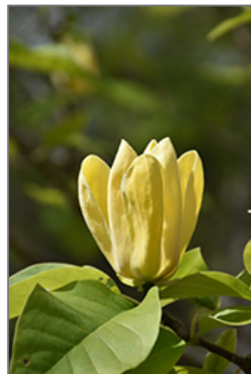
Yellow Bird Magnolia flowers