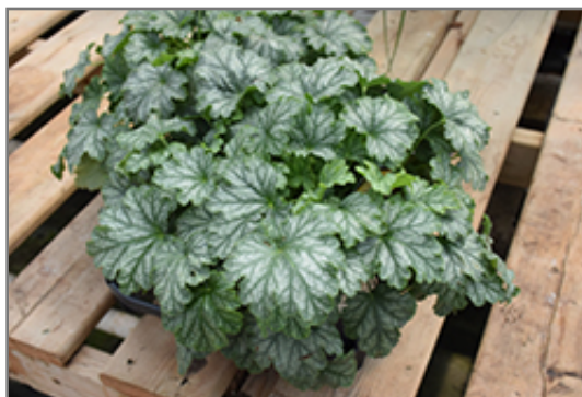
Paris Coral Bells foliage

Paris Coral Bells will grow to be about 8 inches tall at maturity extending to 14 inches tall with the flowers, with a spread of 14 inches. When grown in masses or used as a bedding plant, individual plants should be spaced approximately 12 inches apart. Its foliage tends to remain low and dense right to the ground. It grows at a medium rate, and under ideal conditions can be expected to live for approximately 10 years. As an evergreen perennial, this plant will typically keep its form and foliage year-round.