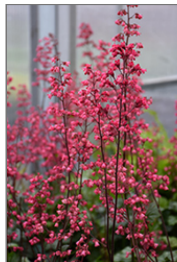
Paris Coral Bells flowers