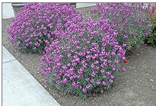
Bowles Mauve Wallflower in bloom