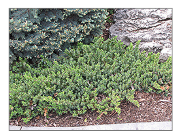
Dwarf Japanese Garden Juniper

This is a relatively low maintenance shrub, and is best pruned in late winter once the threat of extreme cold has passed. Deer don't particularly care for this plant and will usually leave it alone in favor of tastier treats. It has no significant negative characteristics.