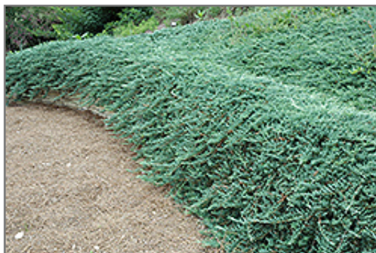
Bar Harbor Juniper