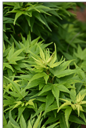
Mikawa Yatsubusa Japanese Maple foliage

Mikawa Yatsubusa Japanese Maple is recommended for the following landscape applications;