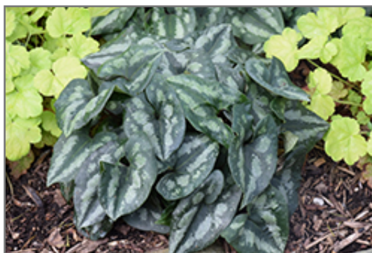
Asian Wild Ginger