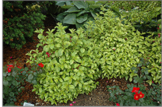
Ghost Weigela

This shrub should only be grown in full sunlight. It prefers to grow in average to moist conditions, and shouldn't be allowed to dry out. It is not particular as to soil type or pH. It is highly tolerant of urban pollution and will even thrive in inner city environments. This is a selected variety of a species not originally from North America.