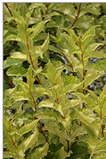
Ghost Weigela foliage