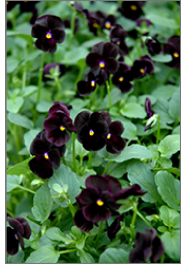
Sorbet Black Delight Pansy flowers