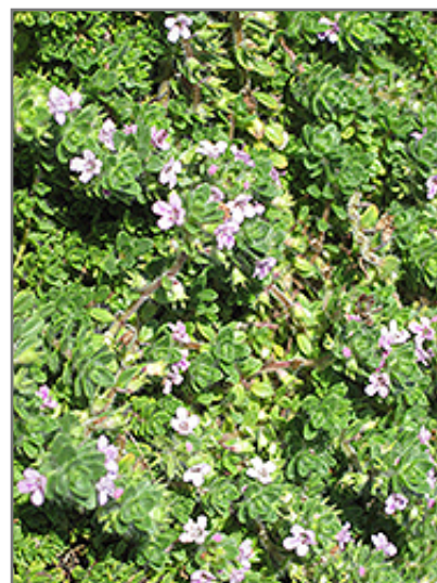
Pink Chintz Creeping Thyme flowers