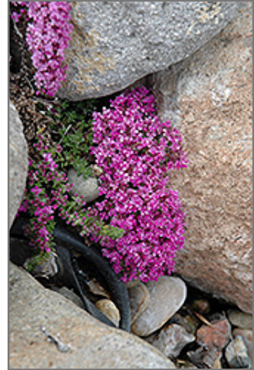
Pink Chintz Creeping Thyme in bloom

This plant should only be grown in full sunlight. It prefers to grow in average to dry locations, and dislikes excessive moisture. It is considered to be drought-tolerant, and thus makes an ideal choice for a low-water garden or xeriscape application. It is not particular as to soil type or pH. It is highly tolerant of urban pollution and will even thrive in inner city environments. Consider covering it with a thick layer of mulch in winter to protect it in exposed locations or colder microclimates. This is a selected variety of a species not originally from North America. It can be propagated by division; however, as a cultivated variety, be aware that it may be subject to certain restrictions or prohibitions on propagation.