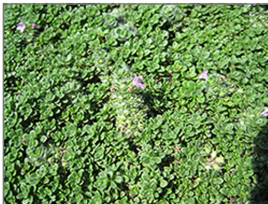
Elfin Creeping Thyme in bloom

Elfin Creeping Thyme is a dense herbaceous evergreen perennial with a ground-hugging habit of growth. It brings an extremely fine and delicate texture to the garden composition and should be used to full effect.