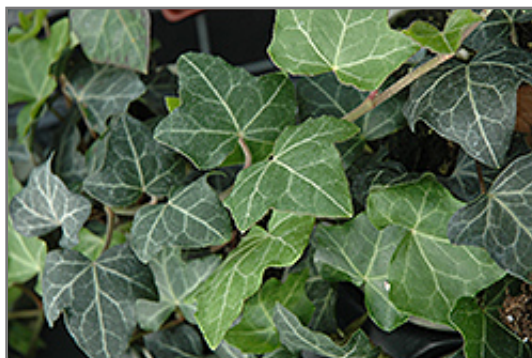
Baltic Ivy foliage