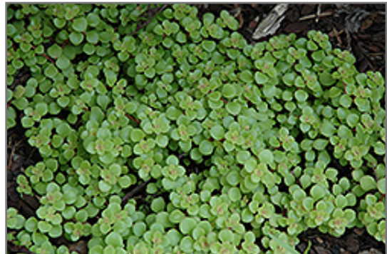
Golden Stonecrop