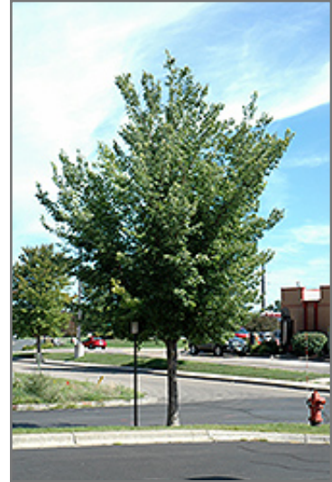
Common Hackberry