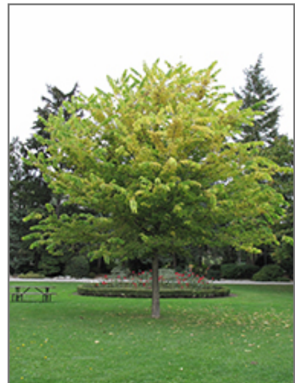
Common Hackberry in fall