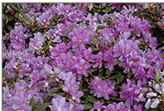
Purple Gem Rhododendron flowers