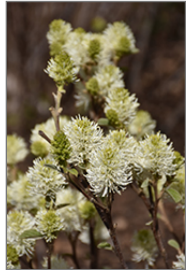
Mt. Airy Fothergilla flowers

Mt. Airy Fothergilla is recommended for the following landscape applications;