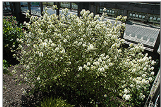
Mt. Airy Fothergilla in bloom