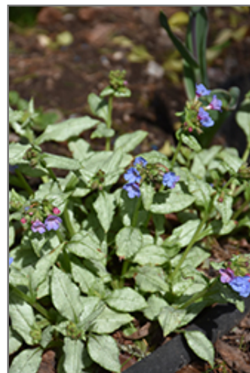
Moonshine Lungwort in bloom

This is a relatively low maintenance plant, and should be cut back in late fall in preparation for winter. It is a good choice for attracting hummingbirds to your yard, but is not particularly attractive to deer who tend to leave it alone in favor of tastier treats. It has no significant negative characteristics.