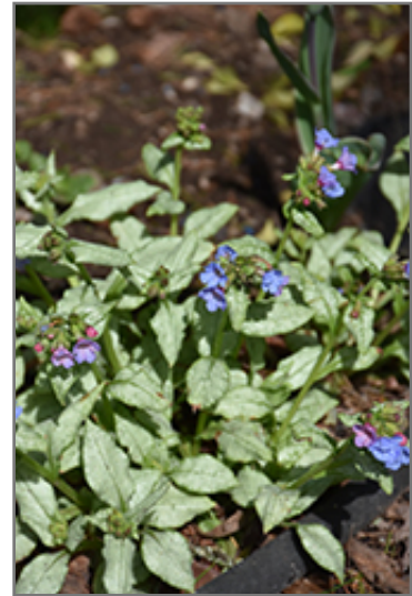
Moonshine Lungwort in bloom

This is a relatively low maintenance plant, and should be cut back in late fall in preparation for winter. It is a good choice for attracting hummingbirds to your yard, but is not particularly attractive to deer who tend to leave it alone in favor of tastier treats. It has no significant negative characteristics.