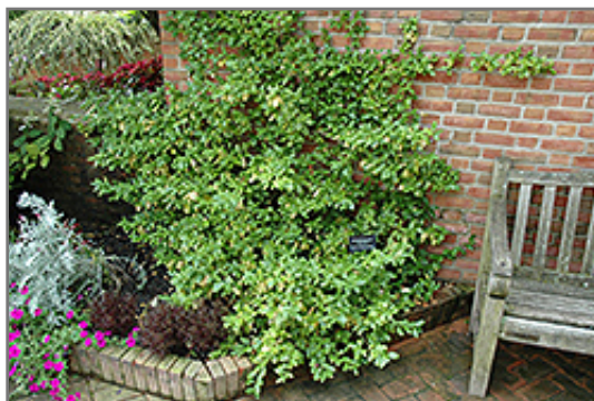
Sarcoxie Wintercreeper