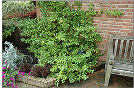
Sarcoxie Wintercreeper