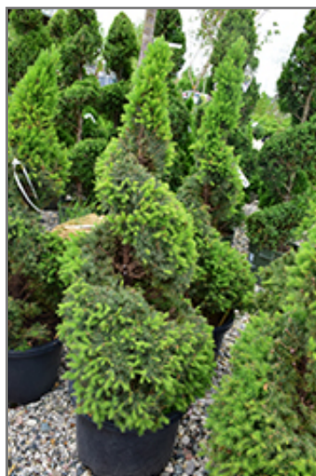
Dwarf Alberta Spruce (topiary form)