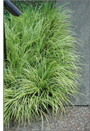
Grassy-Leaved Sweet Flag

Grassy-Leaved Sweet Flag will grow to be about 12 inches tall at maturity, with a spread of 12 inches. Its foliage tends to remain dense right to the ground, not requiring facer plants in front. It grows at a medium rate, and under ideal conditions can be expected to live for approximately 10 years. As an herbaceous perennial, this plant will usually die back to the crown each winter, and will regrow from the base each spring. Be careful not to disturb the crown in late winter when it may not be readily seen!