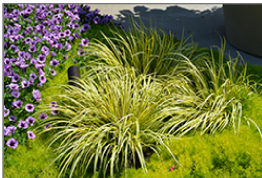
Grassy-Leaved Sweet Flag

Grassy-Leaved Sweet Flag is recommended for the following landscape applications;