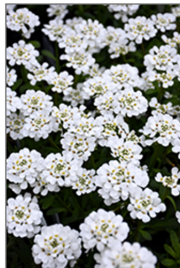
Purity Candytuft flowers