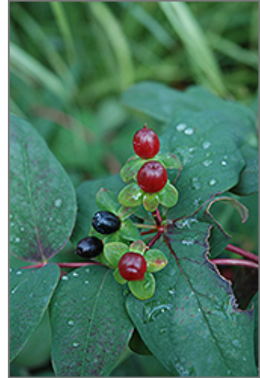
Albury Purple St. John's Wort fruit

* This is a 'special order' plant - contact store for details