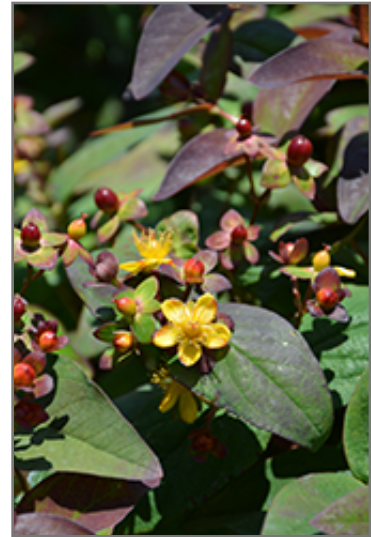
Albury Purple St. John's Wort flowers