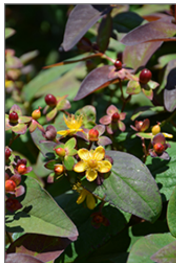
Albury Purple St. John's Wort flowers