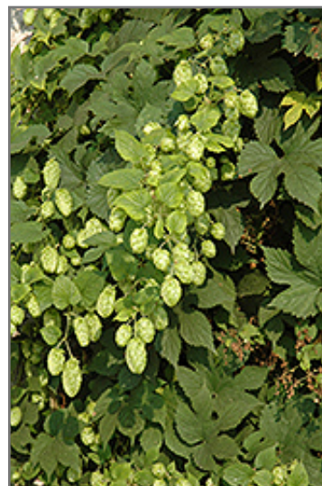
Nugget Ornamental Golden Hops fruit