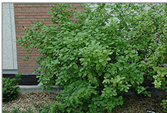
Siberian Dogwood