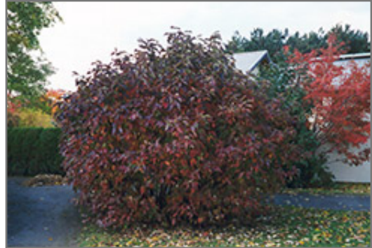
Siberian Dogwood in fall

This shrub does best in full sun to partial shade. It is an amazingly adaptable plant, tolerating both dry conditions and even some standing water. It is not particular as to soil type or pH. It is highly tolerant of urban pollution and will even thrive in inner city environments. This is a selected variety of a species not originally from North America.