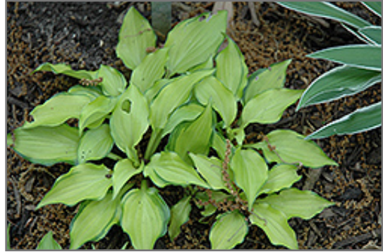
Cracker Crumbs Hosta

Cracker Crumbs Hosta is recommended for the following landscape applications;