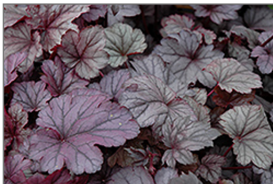
Shanghai Coral Bells foliage

Shanghai Coral Bells is recommended for the following landscape applications;