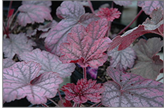
Midnight Bayou Coral Bells foliage

Midnight Bayou Coral Bells is recommended for the following landscape applications;