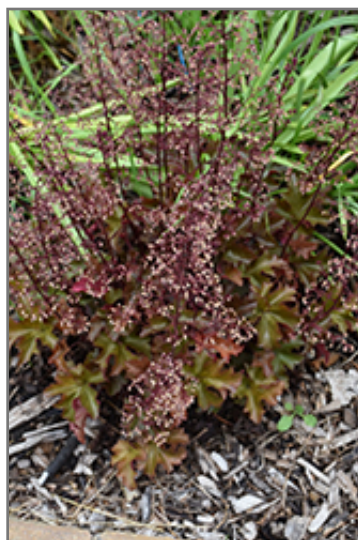
Melting Fire Coral Bells in bloom