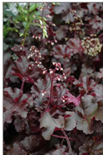
Melting Fire Coral Bells flowers

Melting Fire Coral Bells is a fine choice for the garden, but it is also a good selection for planting in outdoor pots and containers. It is often used as a 'filler' in the 'spiller-thriller-filler' container combination, providing a mass of flowers and foliage against which the larger thriller plants stand out. Note that when growing plants in outdoor containers and baskets, they may require more frequent waterings than they would in the yard or garden. Be aware that in our climate, most plants cannot be expected to survive the winter if left in containers outdoors, and this plant is no exception. Contact our experts for more information on how to protect it over the winter months.