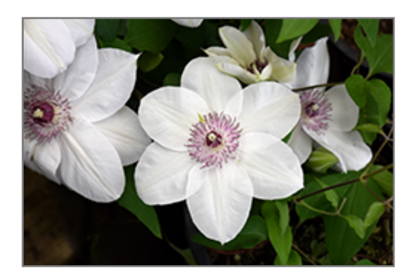
Miss Bateman Clematis flowers