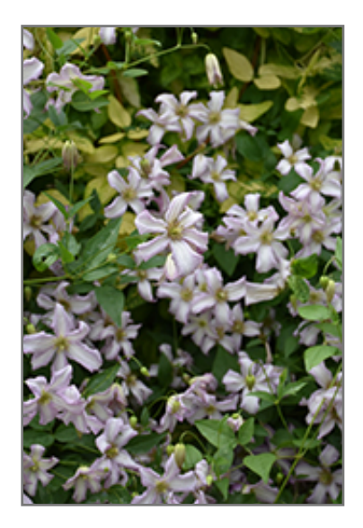
Miss Bateman Clematis flowers