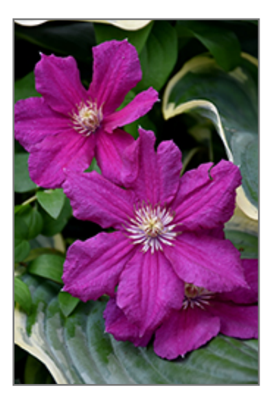
Ernest Markham Clematis flowers