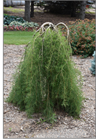
Walker Weeping Peashrub

This shrub does best in full sun to partial shade. It prefers dry to average moisture levels with very well-drained soil, and will often die in standing water. It is considered to be drought-tolerant, and thus makes an ideal choice for xeriscaping or the moisture-conserving landscape. It is not particular as to soil type or pH, and is able to handle environmental salt. It is highly tolerant of urban pollution and will even thrive in inner city environments. This is a selected variety of a species not originally from North America.