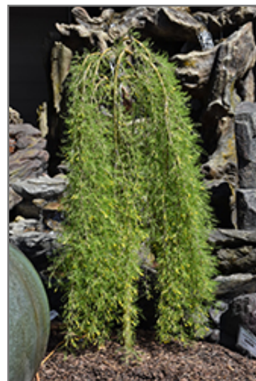
Walker Weeping Peashrub

Walker Weeping Peashrub is recommended for the following landscape applications;