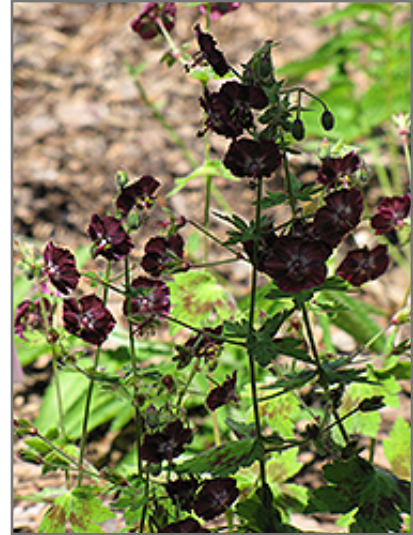
Samobor Cranesbill in bloom

Samobor Cranesbill is recommended for the following landscape applications;