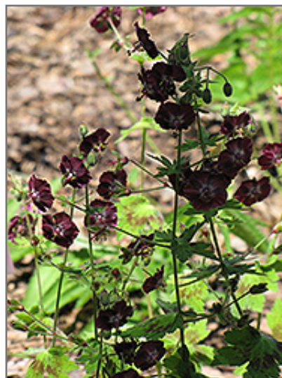
Samobor Cranesbill in bloom

Samobor Cranesbill is recommended for the following landscape applications;