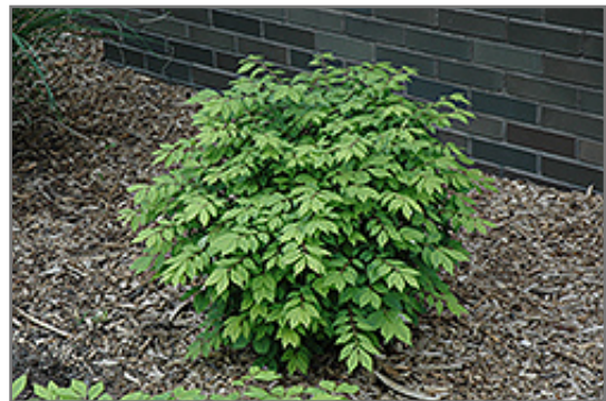
Little Moses Burning Bush