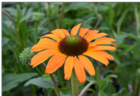
Tangerine Dream Coneflower flowers

Tangerine Dream Coneflower is recommended for the following landscape applications;